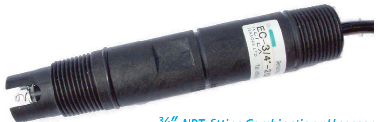
3/4" NPT fitting Combination pH sensor Robust sensor & fitting - ideal for Chemical Process Industry