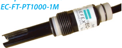
REFEX™ separate electrodes with free turning collars for Flow Cell applications