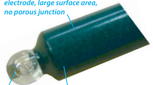
No fouling, clogging, electrolyte leakage, or poisoning of reference