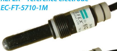
REFEX™ reference electrode EC-FT-5710-1M

Patented REFEX™ pH sensors are available as combination probes and as separate electrodes. Robust construction, accurate and repeatable performance make them the ideal choice for many applications in chemically hostile and abrasive environments.