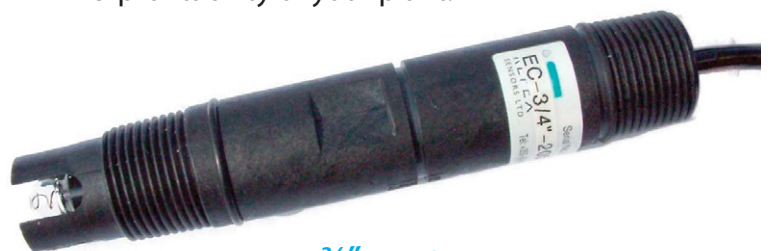
3/4" NPT fitting Combination pH sensor Robust sensor & fitting - ideal for Chemical Process Industry