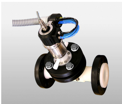
Installation on EXtract 820 with flow vessel EXflow720