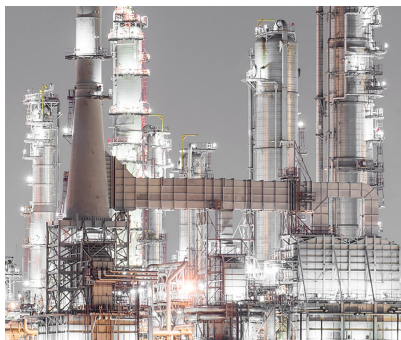
Usable for industrial applications