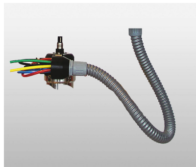
Simple connection of all control tubes with EXconnect 150