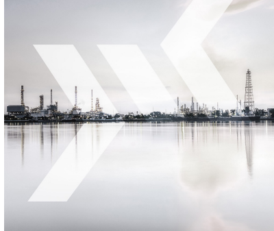
Usable for industrial applications