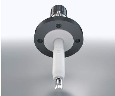
Armature in measuring position, the protective cage is made of high-quality Hastelloy C22