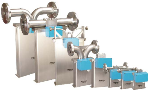
Some of the many RHM mass flow sensors available

The RHM range of mass flow sensors features: