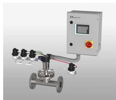
Measuring point with probe housing, flow-through fitting and control unit