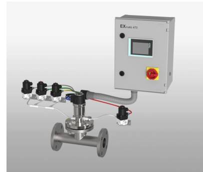
Measuring point with probe housing, flow-through fitting and control unit