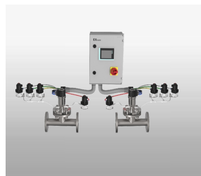
Measuring point with probe housings, flow-through fittings and control unit