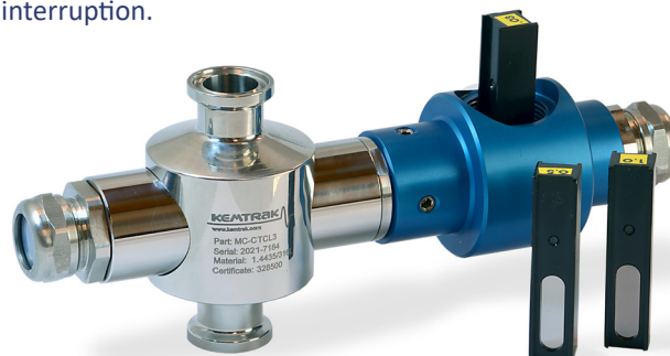
Integrated NIST validation accessory

The convenient range of small-footprint, zero dead-volume hygienic measurement cells that contain no electronics or moving parts are well suited for both ordinary and hazardous area installation. Standard NIST-traceable validation filters can be used to verify analyzer performance without process interruption.