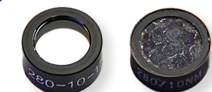
left: Optical filter used on a Kemtrak DCP007-UV photometer right: Eroded optical filter from a traditional hot mercury vapor lamp photometer

The proprietary dual wavelength, four channel measurement technique used in the DCP007-UV analyzer provides deep absorbance measurement to 5 AU using a 1 cm optical path-length. A range of shorter optical path-lengths allow for even deeper absorbance and optical density measurements.