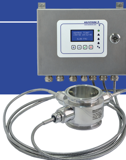
Kemtrak TC007 Measurement Range

QuickCal validation and calibration accessories simplify the procedure of instrument calibration and verification by removing the time-consuming and hazardous task of handling liquid standards.