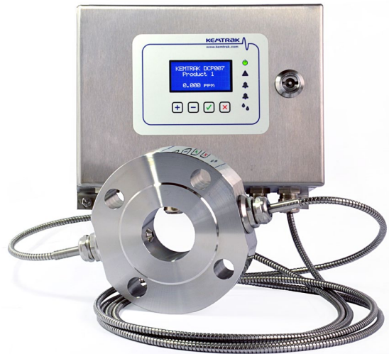
Figure 3: Kemtrak DCP007 NIR photometer with DIN DN50 measurement cell.

Turbid emulsions are accurately measured using the reference wavelength of a Kemtrak DCP007 NIR photometer, allowing both dissolved and suspended water to be monitored. Alternatively, a Kemtrak TC007 turbidimeter is suitable for monitoring water at concentrations above the solubility point. The instruments are calibrated in units of ppm water, providing an accurate measurement of the water content of the sample.