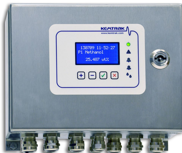
Figure 3 DCP007-NIR Field Mounted Process Photometer Unit

The Kemtrak DCP007-NIR (Figure 2) is a rugged, inline photometric process analyzer designed for precise, continuous concentration monitoring. Using LED technology for light generation and fiber optics to connect to an inline measurement cell, the DCP007-NIR provides accurate, drift-free measurements directly in the process stream as